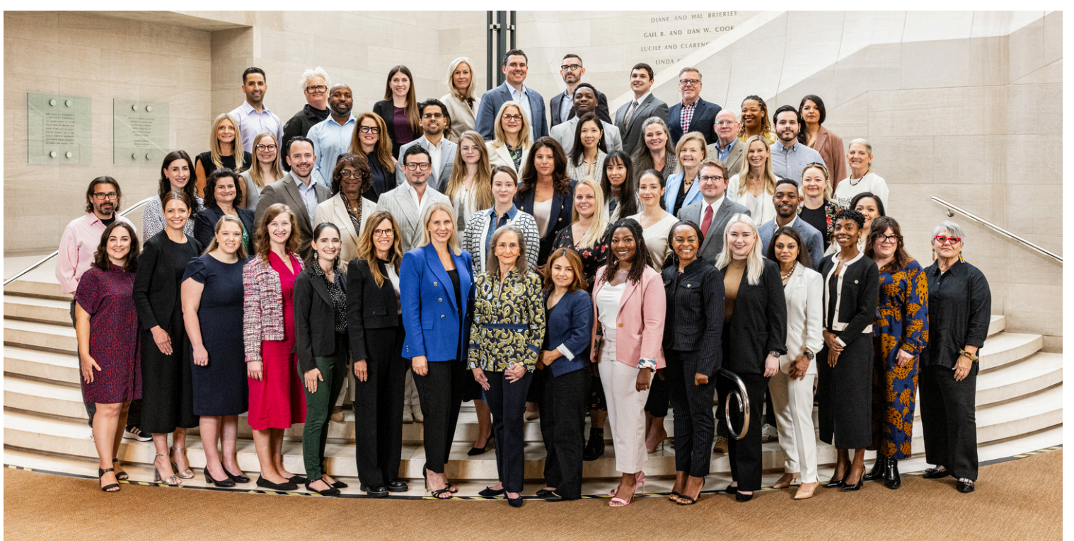
Leadership Arts Institute Class of 2025

Panel discussions with arts organization executive directors and their board chairs, discussions of real-life arts board opportunities and threats, and creativity and innovation exercises mark this program that, over the past 36 years, has placed graduates at more than 170 different non-profit arts and cultural institutions.