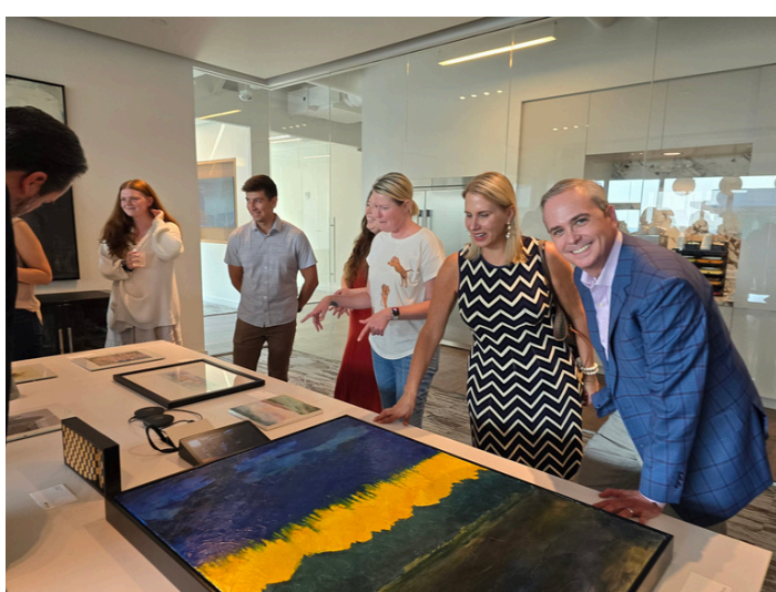
ON MY OWN TIME™ JURYING GFF

For more information about Business Council for the Arts or to join as a BCA member organization, visit ntbca.org .